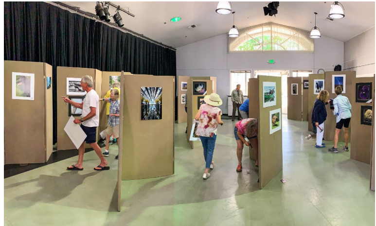
Hanging 4th of July Prints